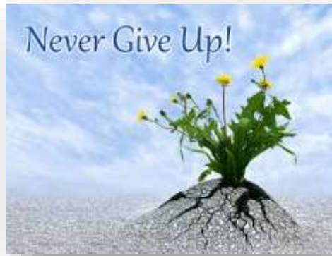
“Never Give Up”

8:30am & 10:30am Services visit www.rumcoh.org